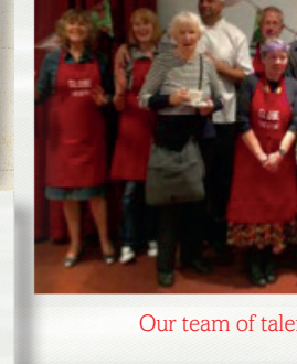
Our team of talented Bakers!