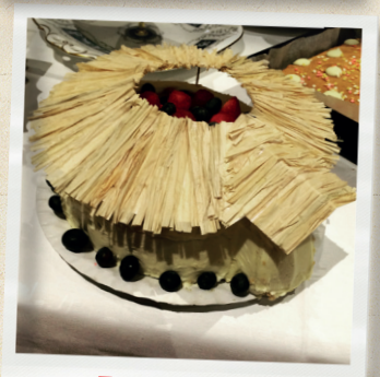
The winning cake!