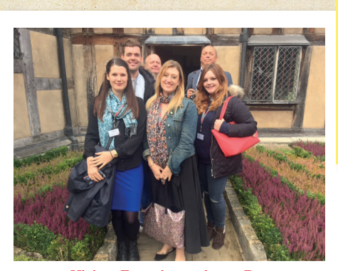
Visitor Experience Away Day at Shakespeare's Birthplace Trust