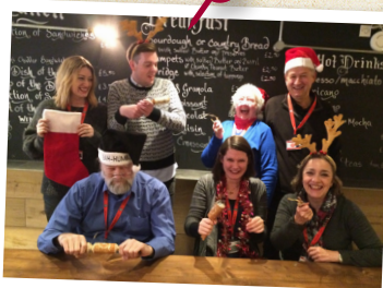
An outtake shot, post cracker pull!