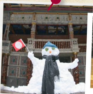
Snowman at the Globe