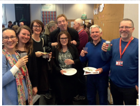
Cheery party-goers at the Start of Season Party!