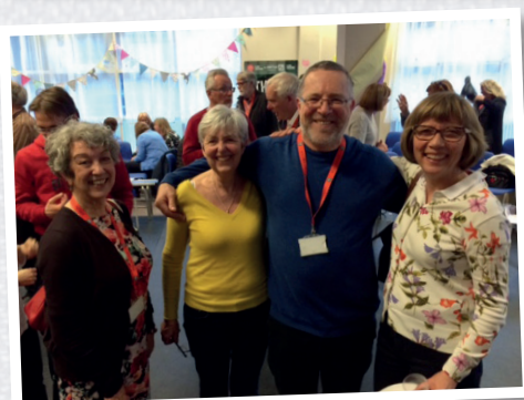
The winning Start of Season Quiz Team! Well done you clever bunch!

Please contact fellow steward Jackie Homewood, jackie.homewood@talktalk.net for rates and availability. To view more, including photos, please go to: ownersdirect.co.uk/accommodation/p8062368