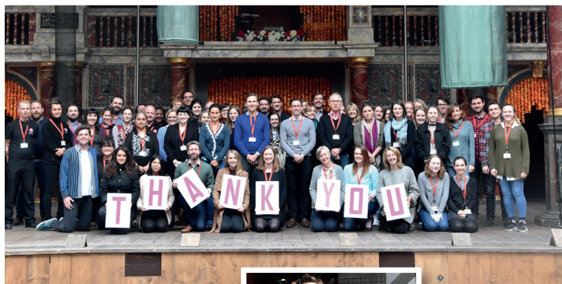
Globe staff gathered on stage to extend their Thanks to all our wonderful Globe Volunteers

Here are some of the snaps we took over Volunteers Week 2016