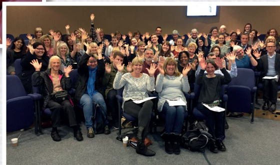
This cheery bunch of new Stewards came for their Welcome Induction in June!

Where: Upstairs at the Gatehouse Above The Gatehouse Pub, Junction of Hampstead Lane, North Rd, London, N6 4BD When: 28 June – 2 July londontheatre.co.uk/show/hindle-wakes