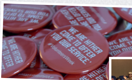
'We are hither come to offer you our service'