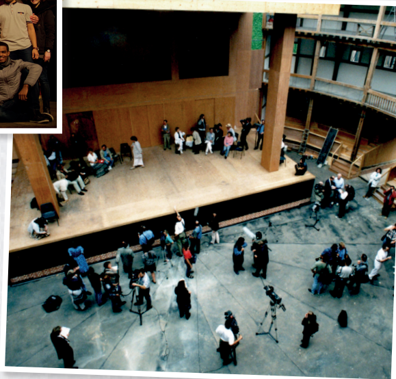
The Globe in 1995