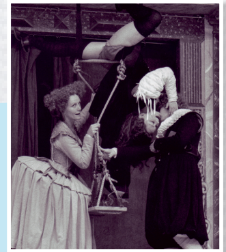
From the archive. Chaste Maid, 1997

'In a drawer lies a t-shirt with rather faded Festival of Firsts design but it's still fine otherwise; these memories will be rather like that.'