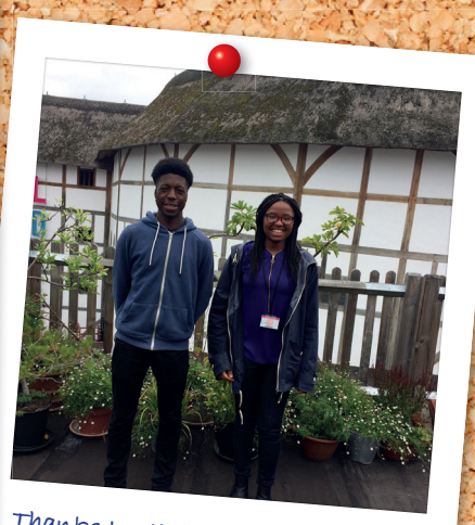
Thanks to all for making them feel so welcome! They had a great time!