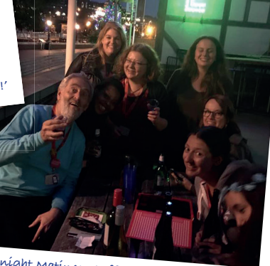
Midnight Matinee, staff and stewards celebrating post show after the Midnight Matinee of Much Ado About Nothing. Huge thanks to all who helped at our last midnight show of the year!