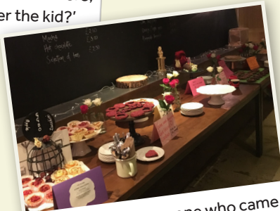
Thank you to everyone who came and baked as part of this year's Bake Off!