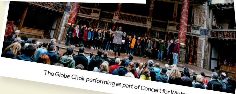
The Globe Choir performing as part of Concert for Winter