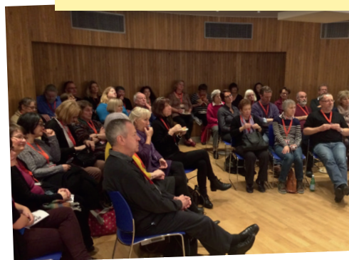
Stewards Communication Session 5 January 2016 – everyone concentrating very hard!