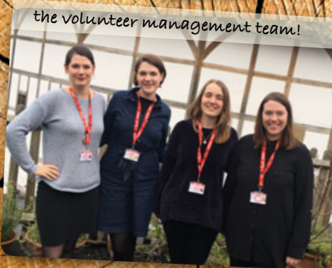
the volunteer management team!