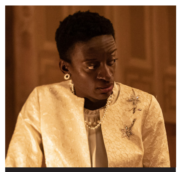
This is Duchess .