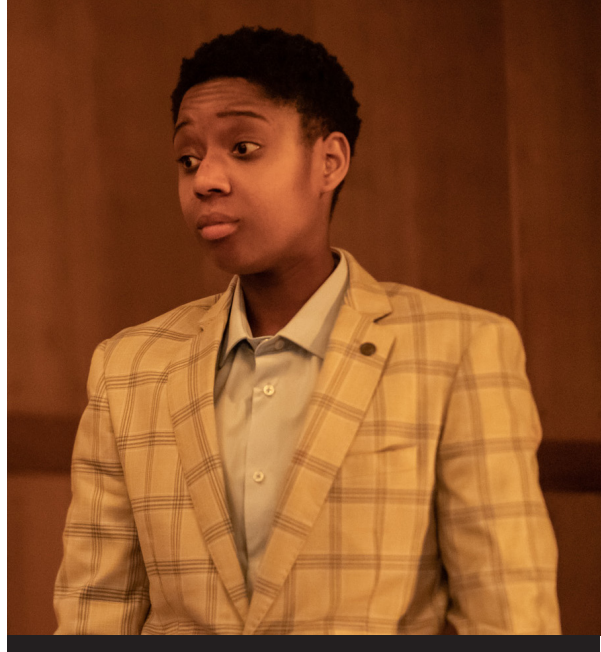
This is Rivers .