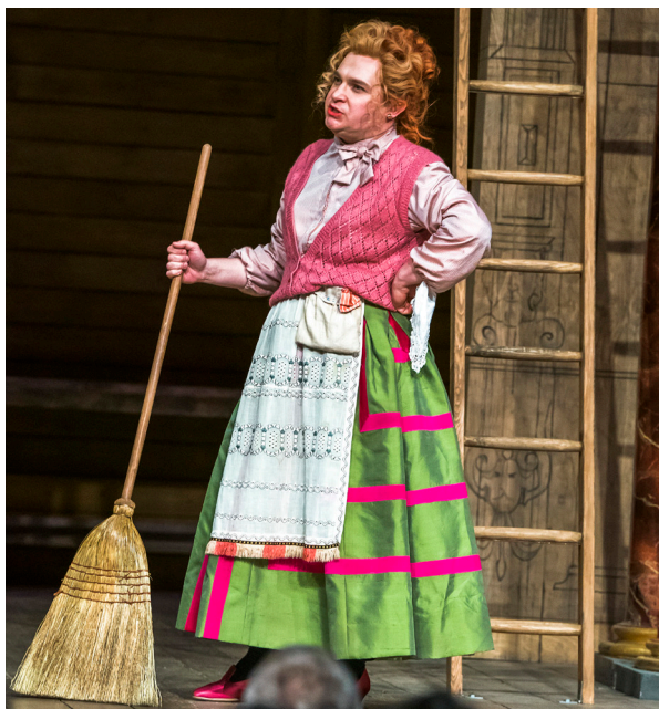
This is Quickly .