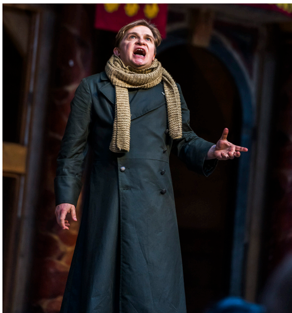
This is Westmorland .