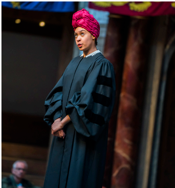
This is Lord Chief Justice .