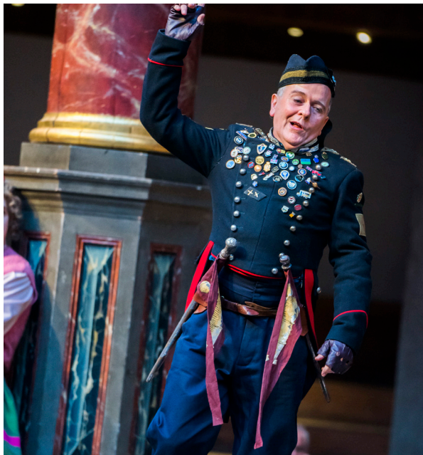
This is Pistol .