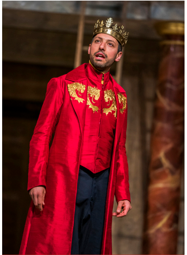
This is Henry IV .