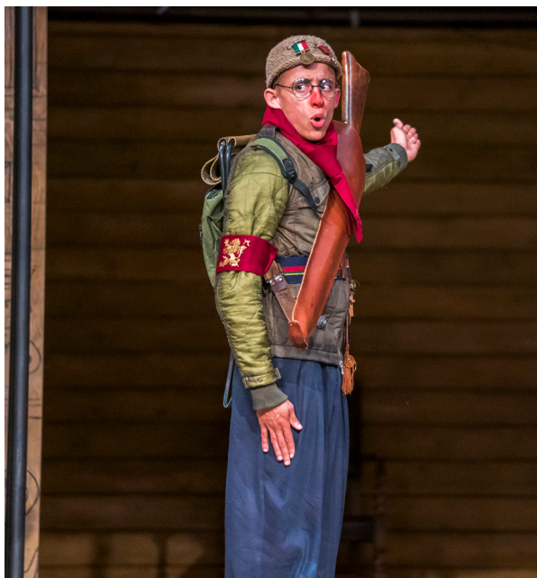
This is Bardolph .