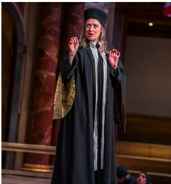
This is Shallow .