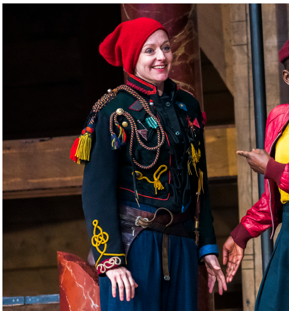
This is Boy .