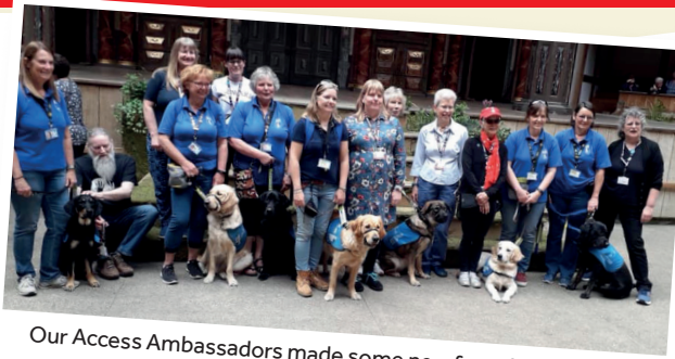
Our Access Ambassadors made some new furry friends as we welcomed these guide dogs in training to the globe.