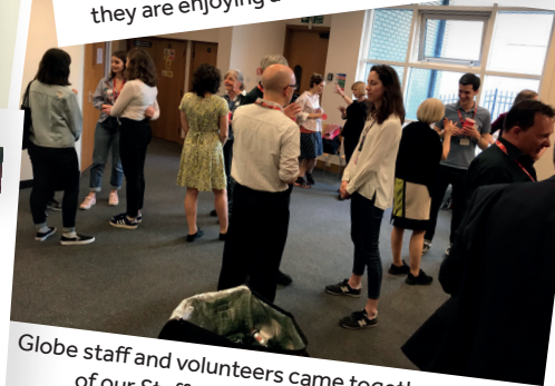
Globe staff and volunteers came together as part of our Staff Speed Networking Event.