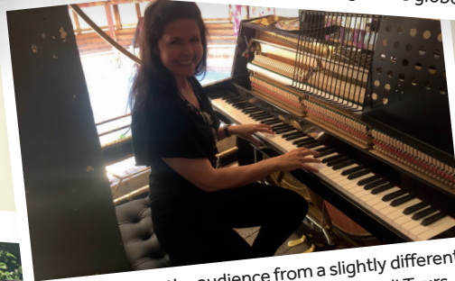
Enjoying seeing the audience from a slightly different perspective as part of the Heaven and Hell Tours