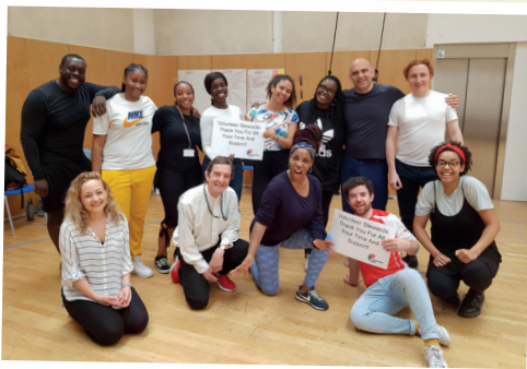
The cast of A Midsummer Night's Dream give their thanks for all that you do as part of Volunteers' Week.