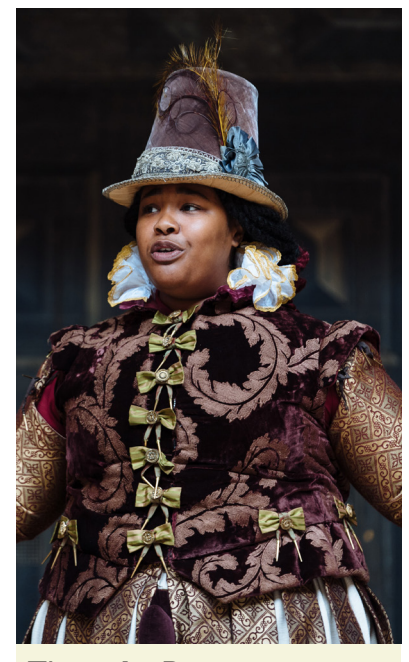
This is Le Beau.