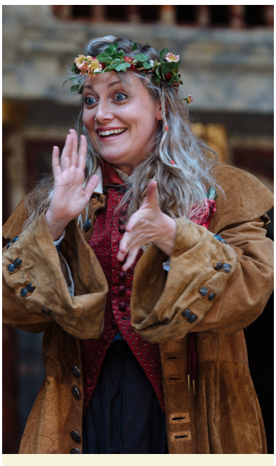
This is Duke Senior .