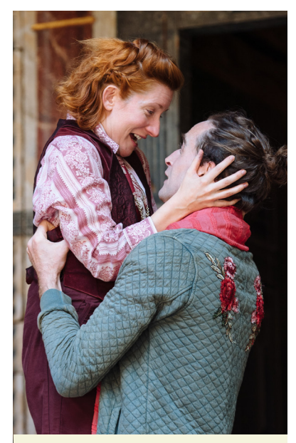
This is Orlando and Rosalind (dressed as Ganymede).