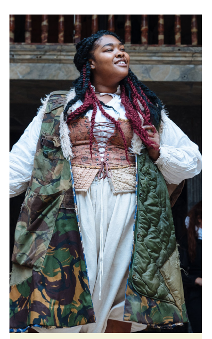
This is Amiens .