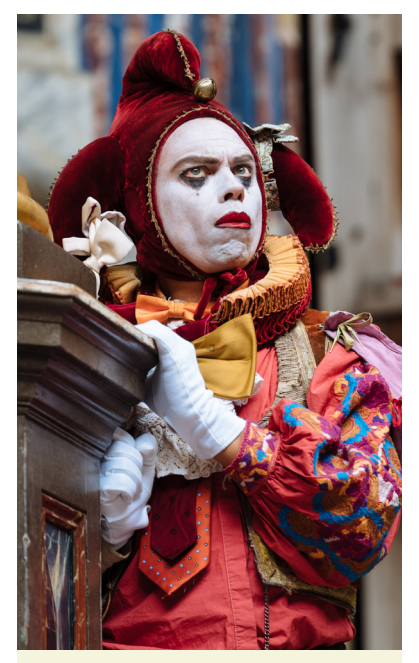
This is Touchstone .