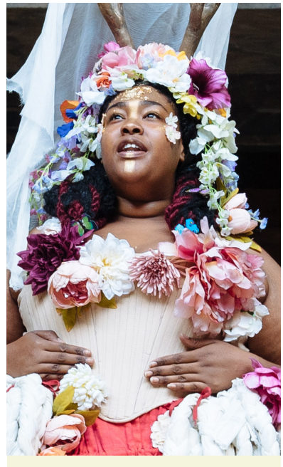
This is Hymen .