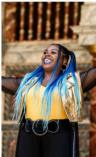
This is Quince .