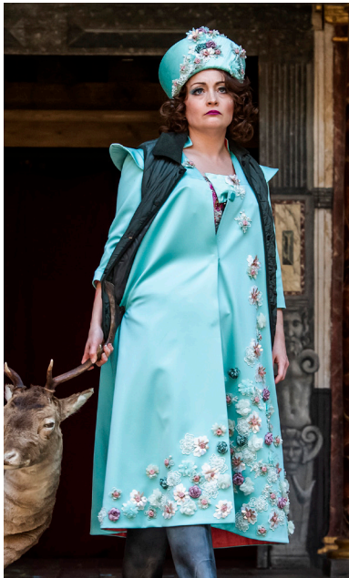
This is Hippolyta .