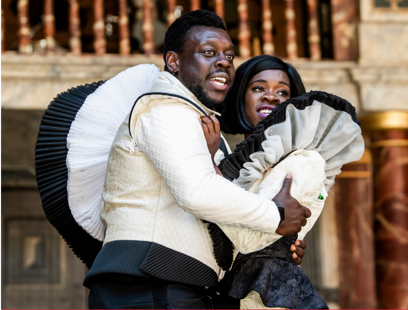
This is Lysander and Hermia .