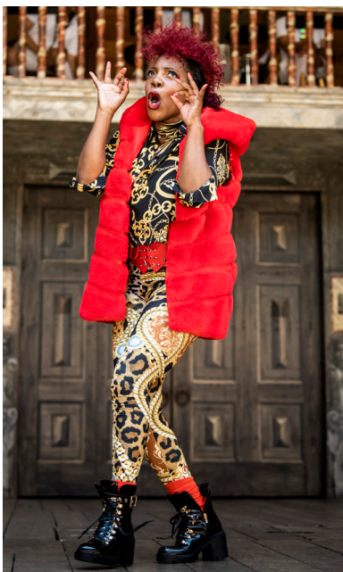
This is Bottom .