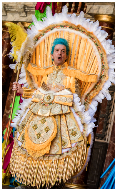
This is Oberon .