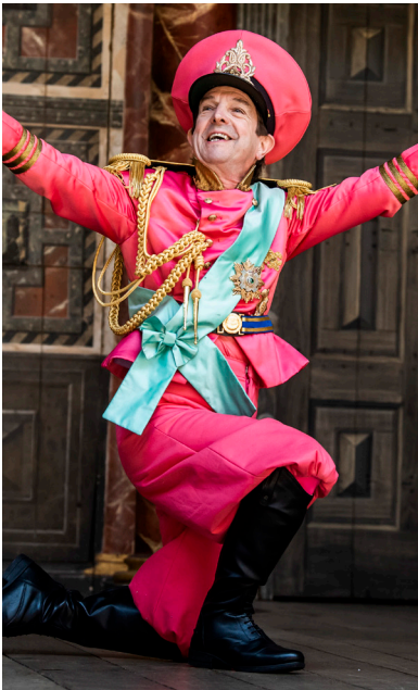
This is Theseus .