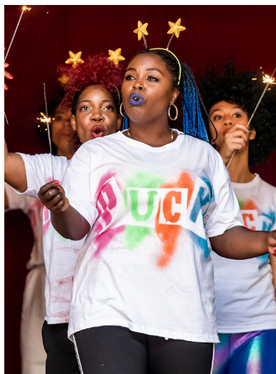
This is Puck . Many of the actors play Puck. They wear t-shirts with 'PUCK' written on them.