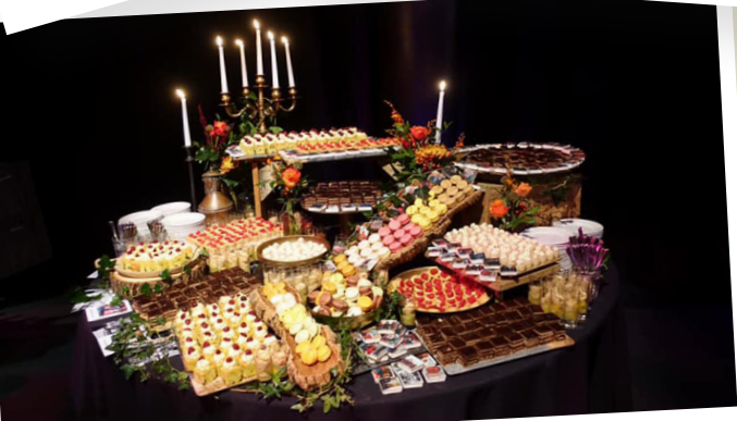
Our delicious desert table which this year featured a series of personalised marshmallows from throughout the season.