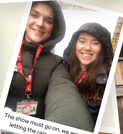
The show must go on, we are not letting the rain get us down