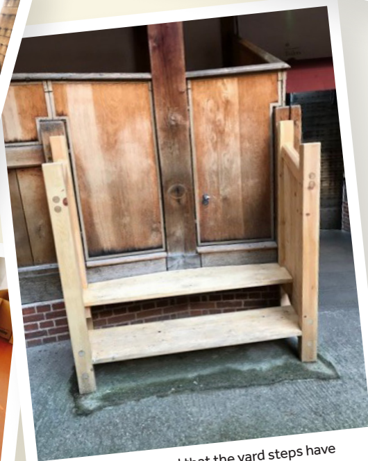
We are delighted that the yard steps have made a return for 2020! You'll find them by Door 1 and 4 and are there to ensure children and adults of a short stature can still get an excellent view of the stage.