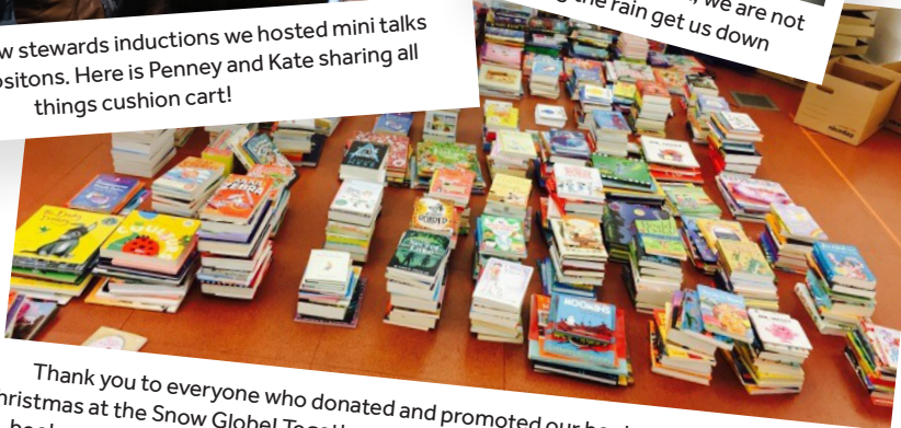
Thank you to everyone who donated and promoted our book collection as part of Christmas at the Snow Globe! Together we as an organisation donated an impressive 2,500 books to three local charities; Home-Start, Evelina Hospital School and Little Village.