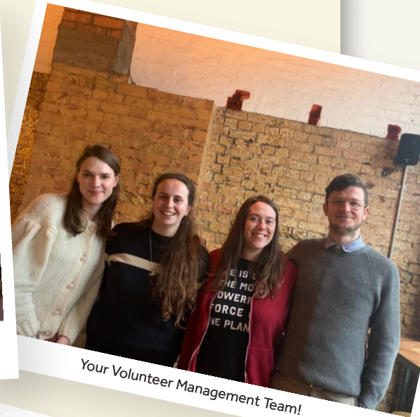
Your Volunteer Management Team!