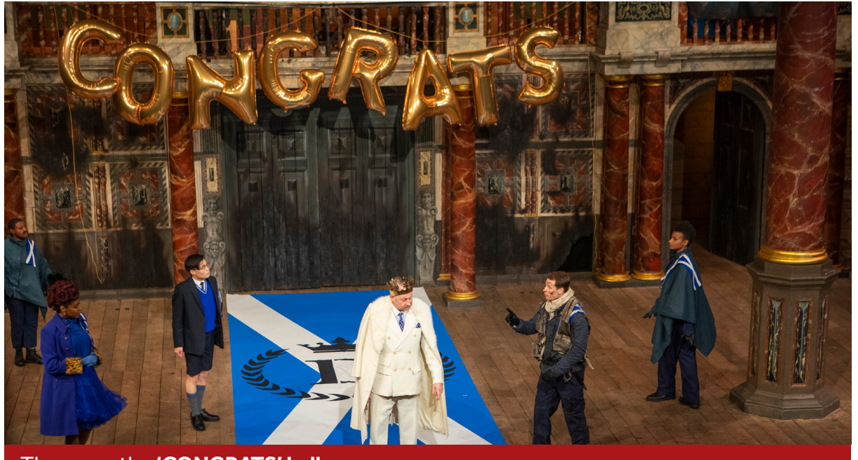
These are the 'CONGRATS' balloons.