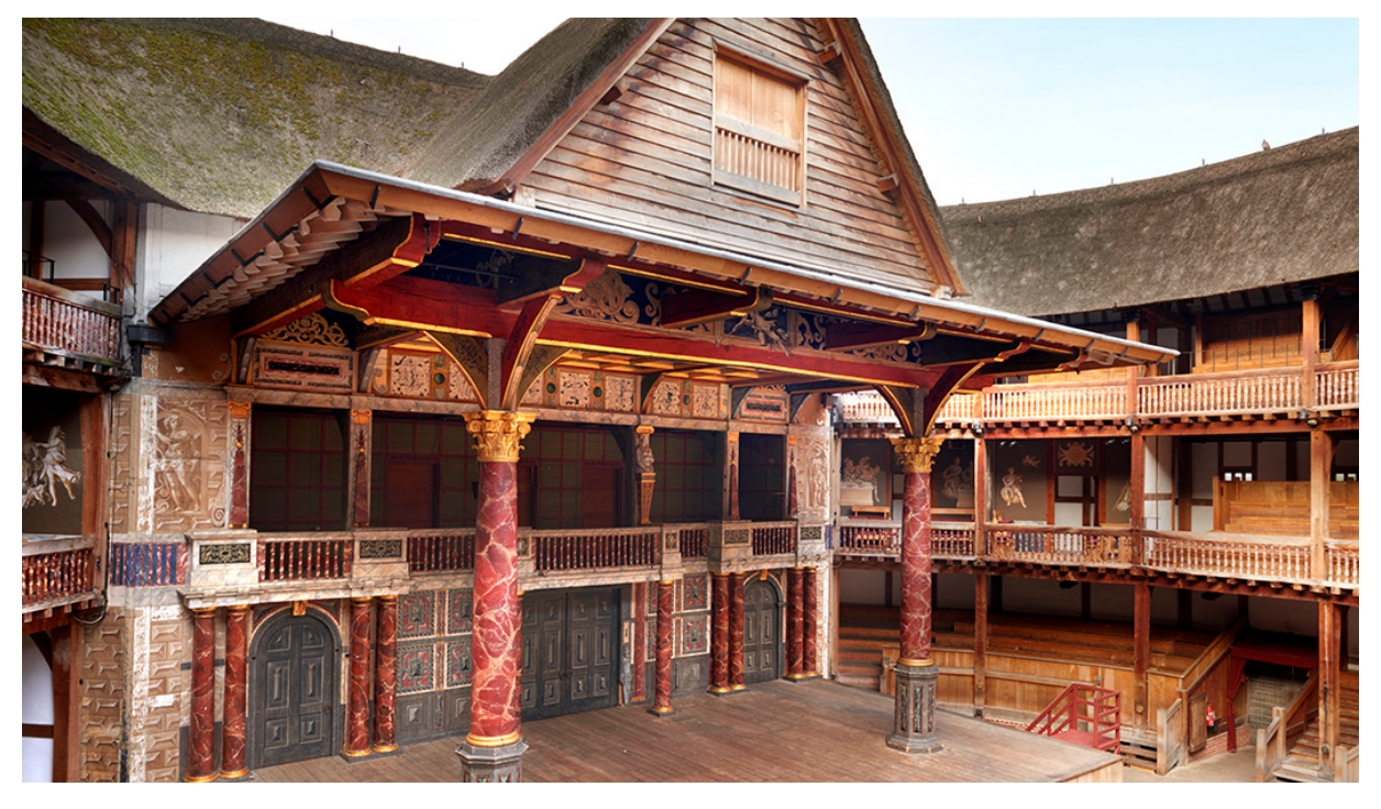
This is the stage. For different plays, designers add pieces of set to make it look different. This is where the actors will be performing.

These are stewards. You can recognise the stewards by their aprons. The stewards are there to help you. If you feel tired, or need to exit please ask a steward. They can also show you where the toilets are. Stewards are good people to go to if you feel worried about anything.