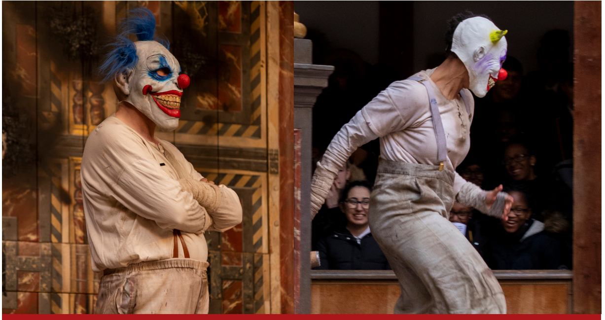
These are The Murderers in clown masks .