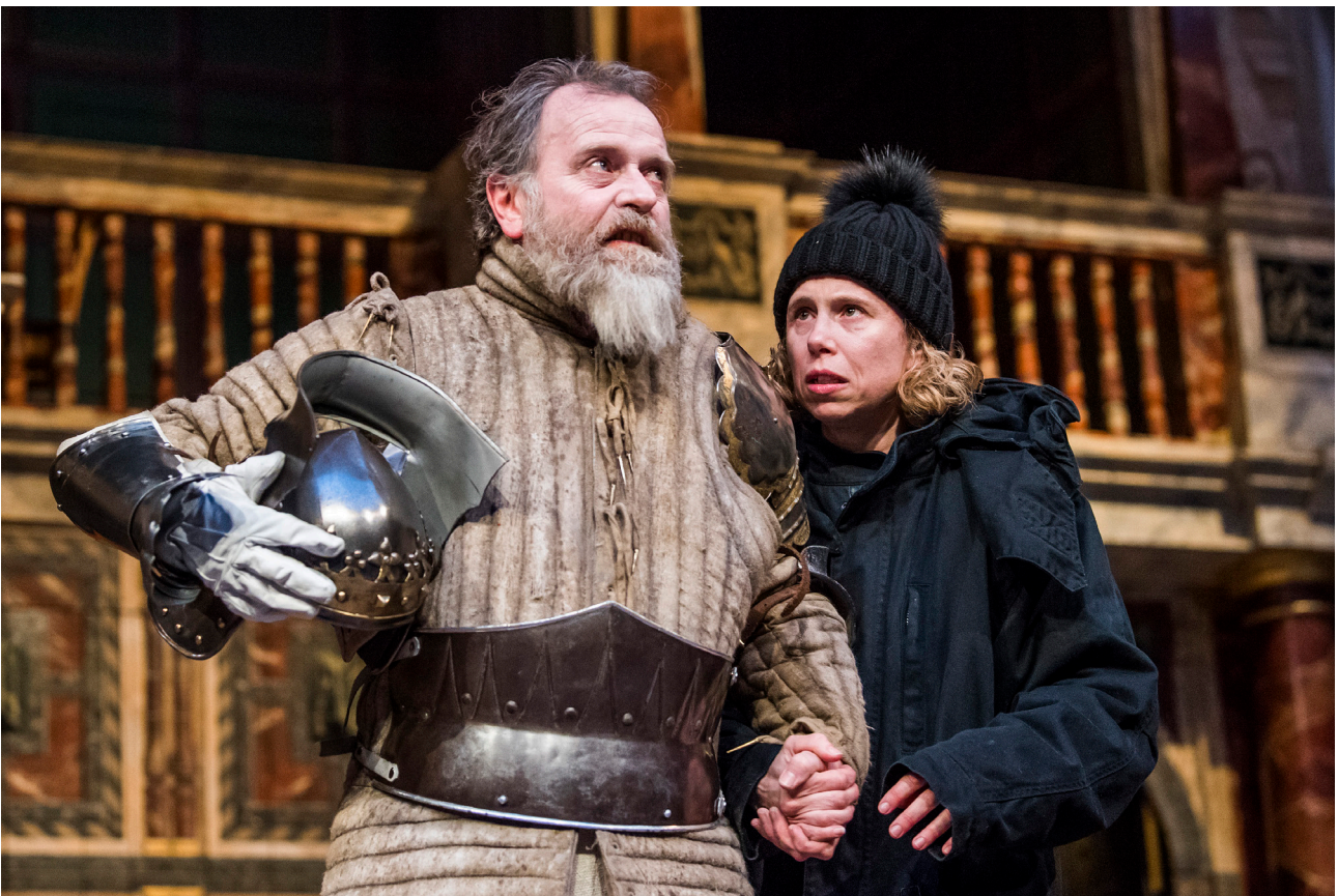
Ghost and Hamlet

Ophelia comes to Polonius and tells him that Hamlet has been acting strangely. Polonius concludes Hamlet's madness is lovesickness and departs to tell Claudius.