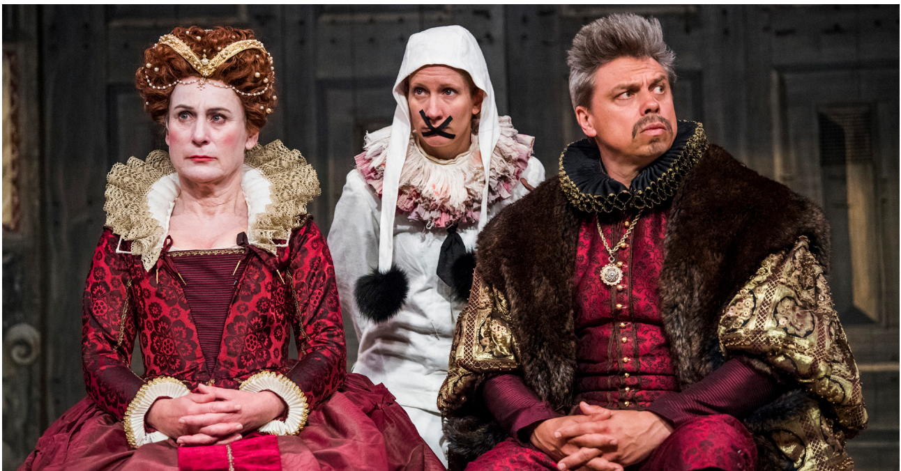
Claudius and Gertrude

Claudius has been crowned and has married Gertrude. He grants Laertes permission to return to France but tells Hamlet he must remain in Denmark. Hamlet wishes he was dead. Horatio arrives and tells Hamlet about the ghost.