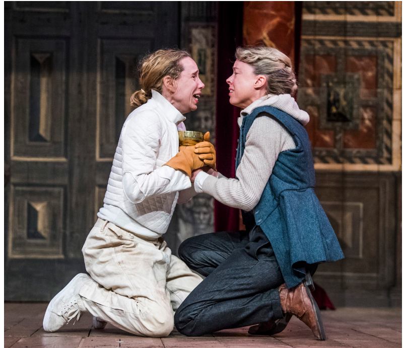
Hamlet and Horatio

At Elsinore Castle in Denmark, an officer called Bernardo is the watches over the castle walls. He is joined by Marcellus and Horatio, and all witness the ghost of King Hamlet. The ghost appears twice, but disappears.