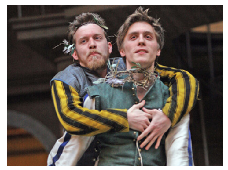
This is Mercutio and Benvolio