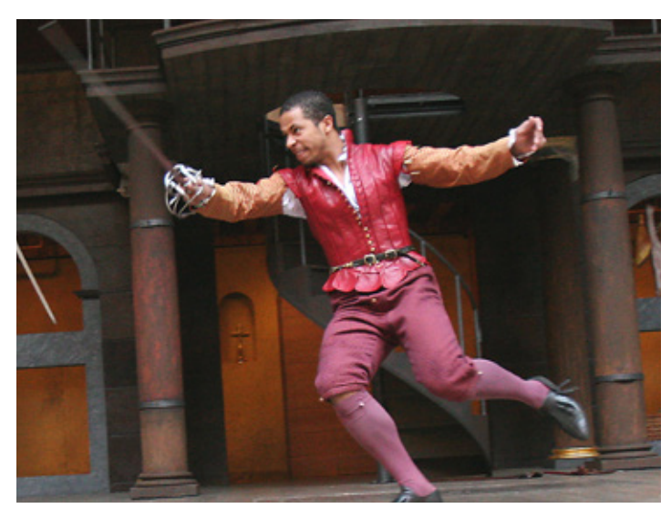
This is Tybalt