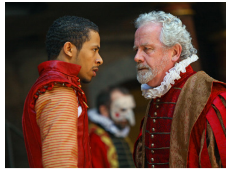
This is Tybalt and Lord Capulet