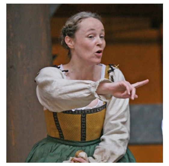
This is Nurse