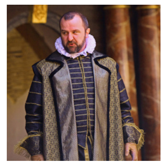
This is Prince