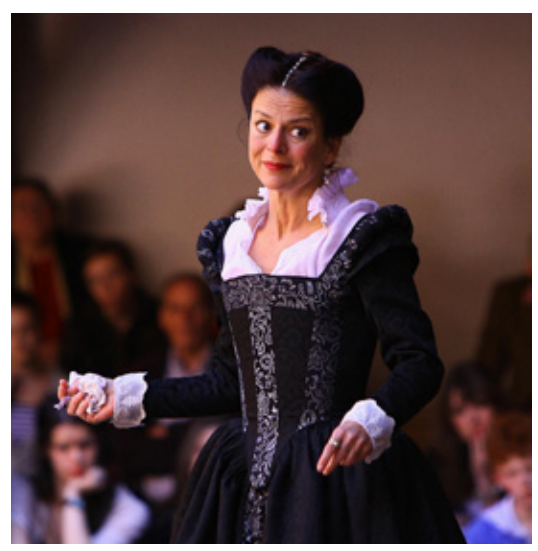
This is Lady Capulet