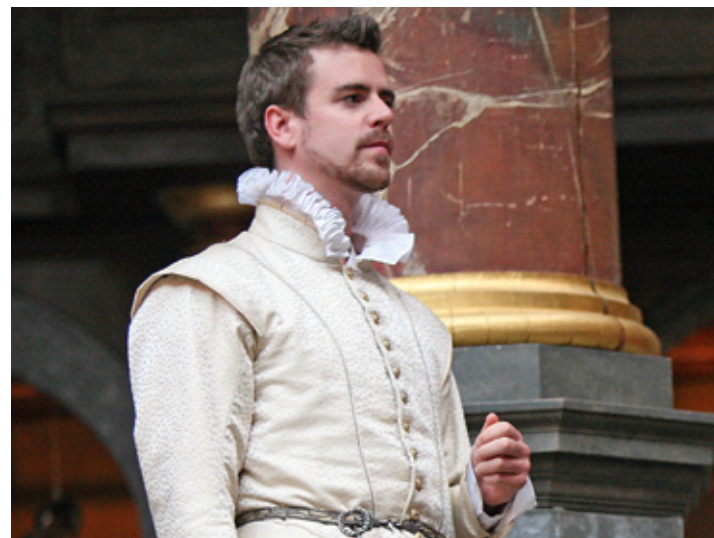
This is Paris