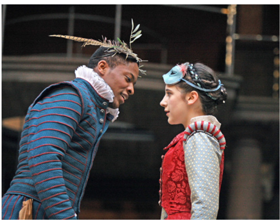
This is Romeo and Juliet