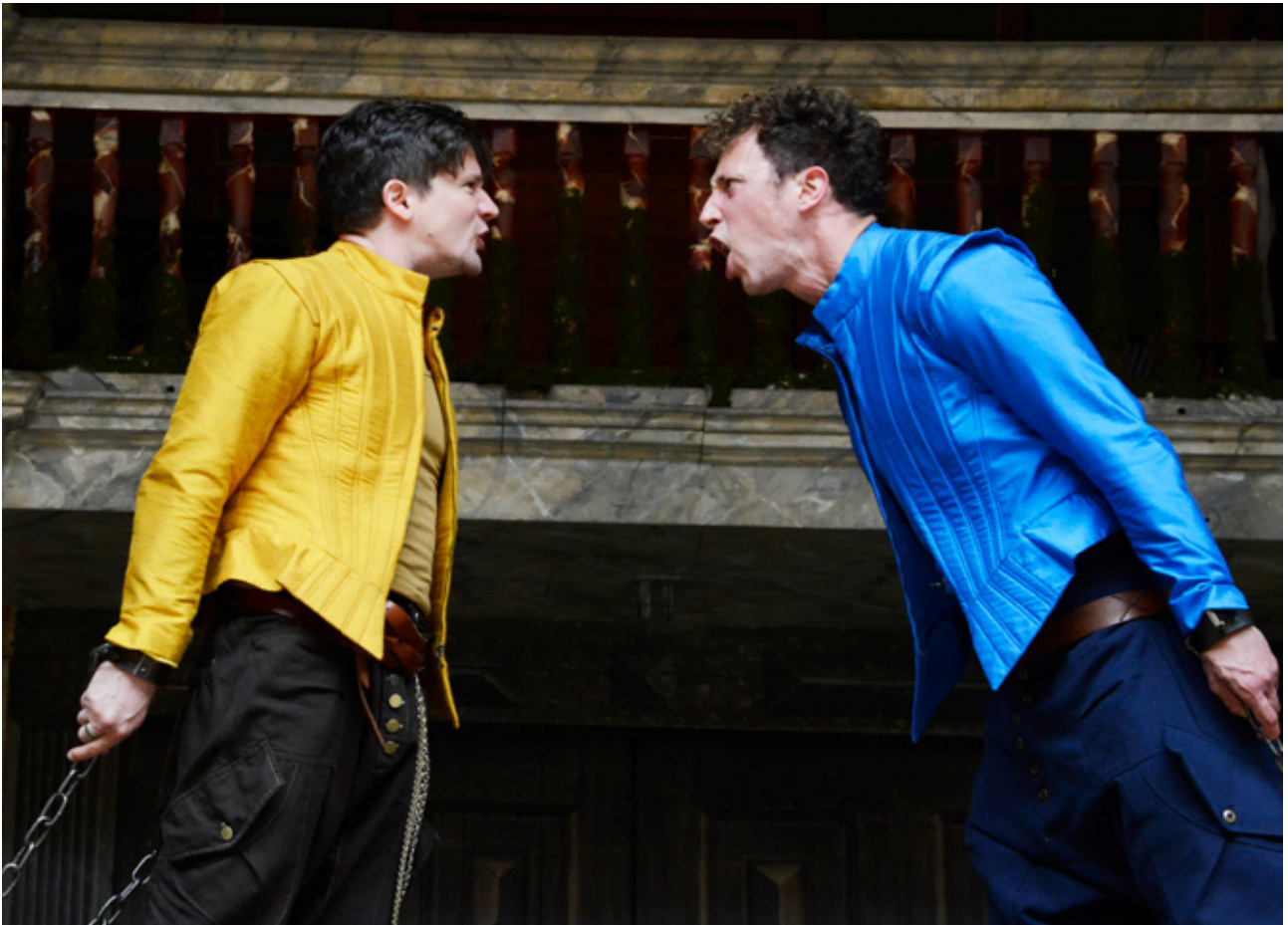
This is Palamon and Arcite

Palamon and Arcite fight. Arcite wins and Palamon is sent to be executed. However, Arcite is thrown from his horse and is injured before he reaches Emilia. Arcite is brought to see Emilia, and before he dies he says that she should marry Palamon.