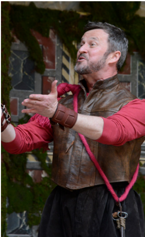
This is the jailer

Palamon hides. He later sees Arcite and reveals himself. Arcite helps his friend by bringing him food. Because they both love Emilia they fight each other. Theseus finds them and they explain everything to him. Theseus tells them that they will fight and whoever wins the fight will be married to Emilia.