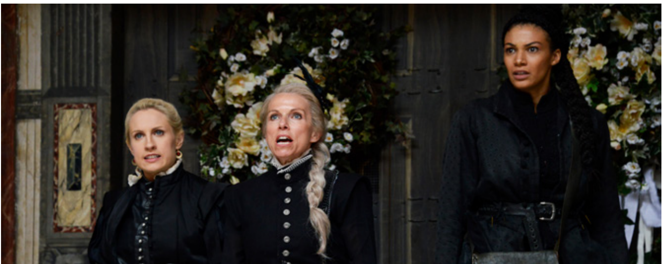
These are the Queens

Three queens arrive at Theseus's court. They beg him to go to war against Creon.