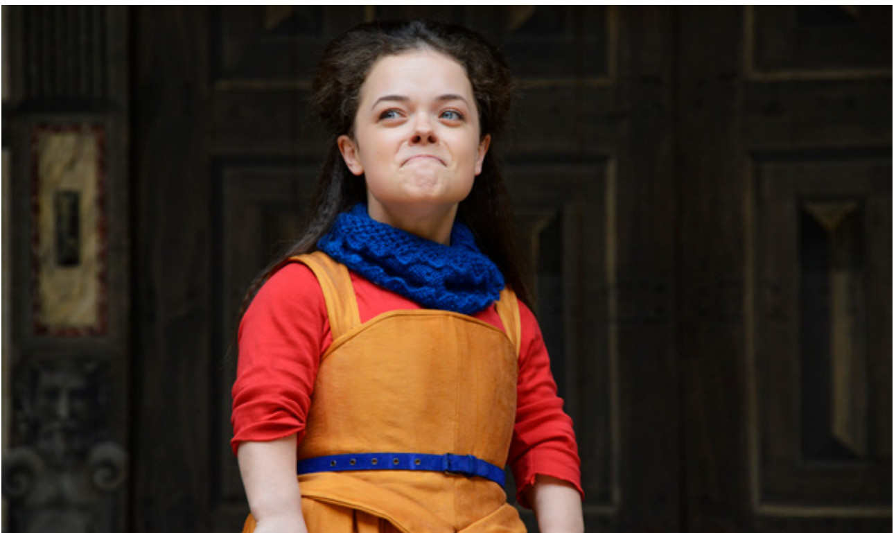
This is the jailer's daughter

Their jailer has a daughter. She falls in love with Palamon. Another man loves the jailer's daughter, but she ignores him.