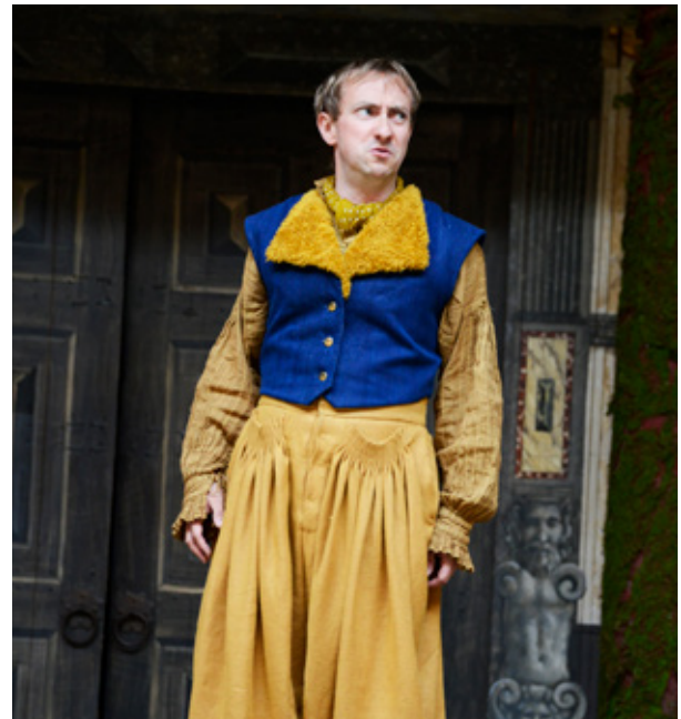
This is the lover

The Jailer's daughter gets Palamon out of jail. He runs away from her, but she follows. However, the sad fact that he doesn't love her makes her unwell. She becomes included in a dance put on for Theseus and Hippolyta.