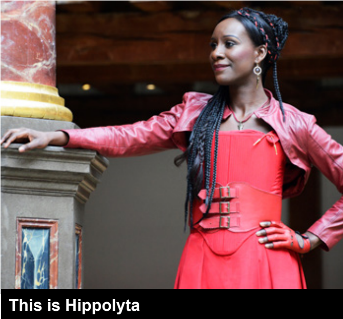
This is Hippolyta

Hippolyta and Emilia agree with the queens. They also beg with Theseus.