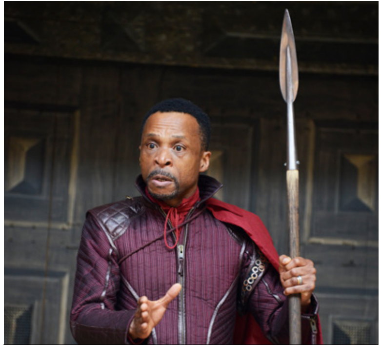
This is Theseus

Three queens arrive at Theseus's court. They beg him to go to war against Creon.