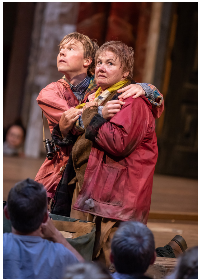
Old Shepherd and the Clown

Antigonus arrives in Bohemia. He leaves the baby with gold in a remote place. Before he can go home he is eaten by a bear. Two shepherds find the child and the old shepherd adopts her.