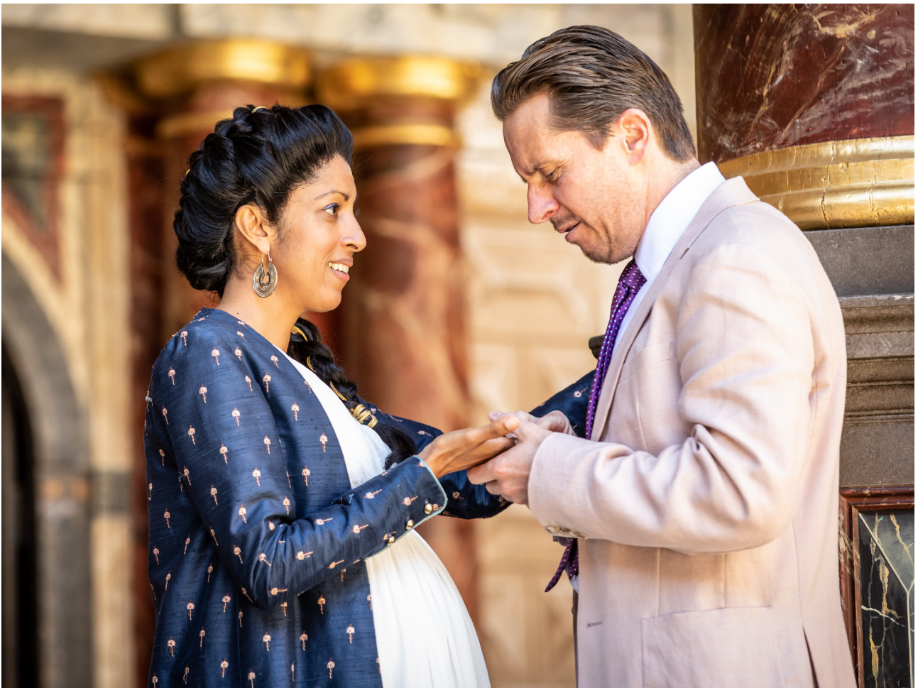
Hermione and Polixenes

In prison, Hermione has a baby girl. Leontes orders that Paulina's husband, Antigonus, take the baby to a remote place and leave its survival to chance.