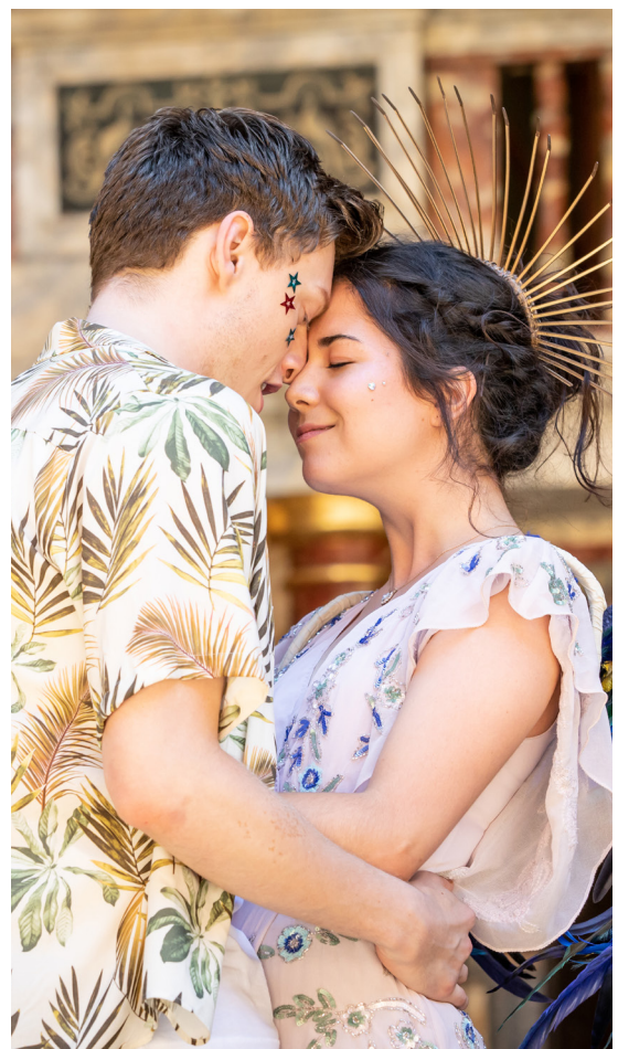
Perdita and Florizel

The statue comes to life. Hermione, Leontes and Perdita are reunited.