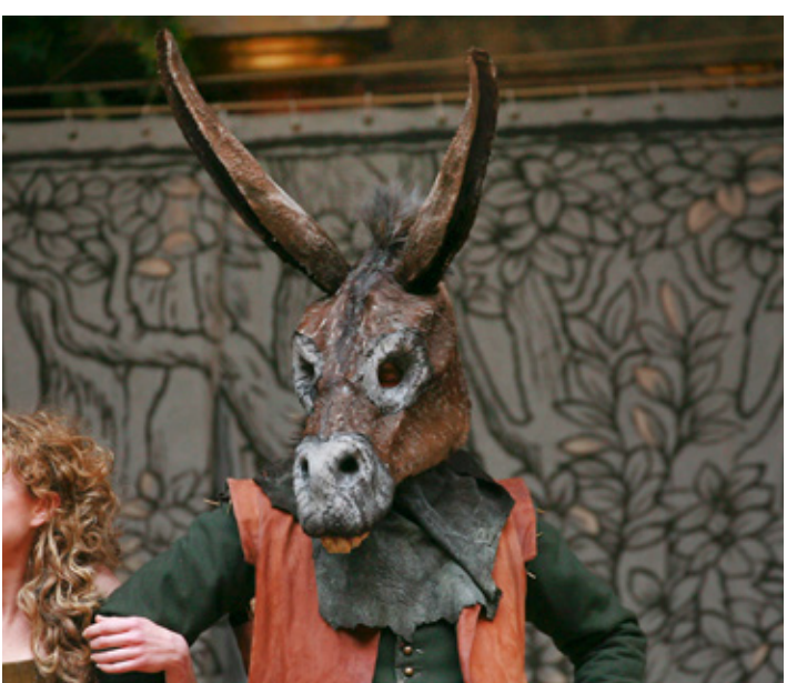
Nick Bottom One of the six actors staging the play Pyramus and Thisbe. His head is transformed into a Donkey's head, and Titania falls in love with him.