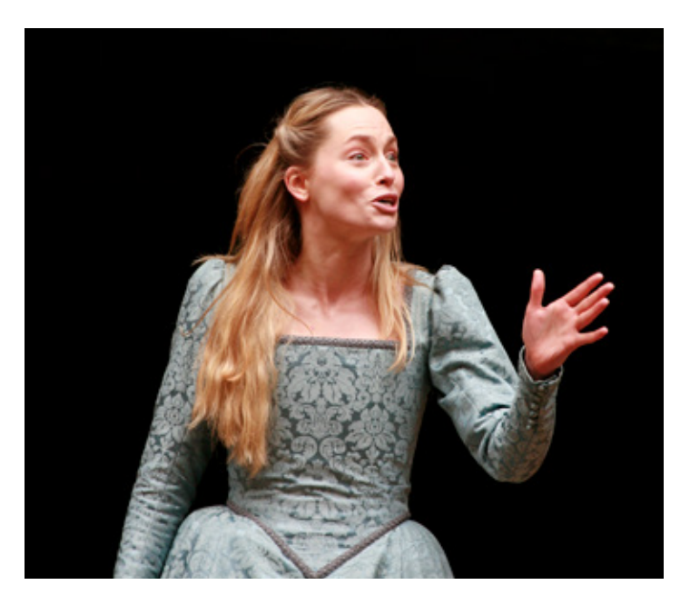
Helena Is in love with Demetrius, but Demetrius isn't in love with her. He is friends with Hermia. She follows Hermia, Lysander, and Demetrius to the forest.