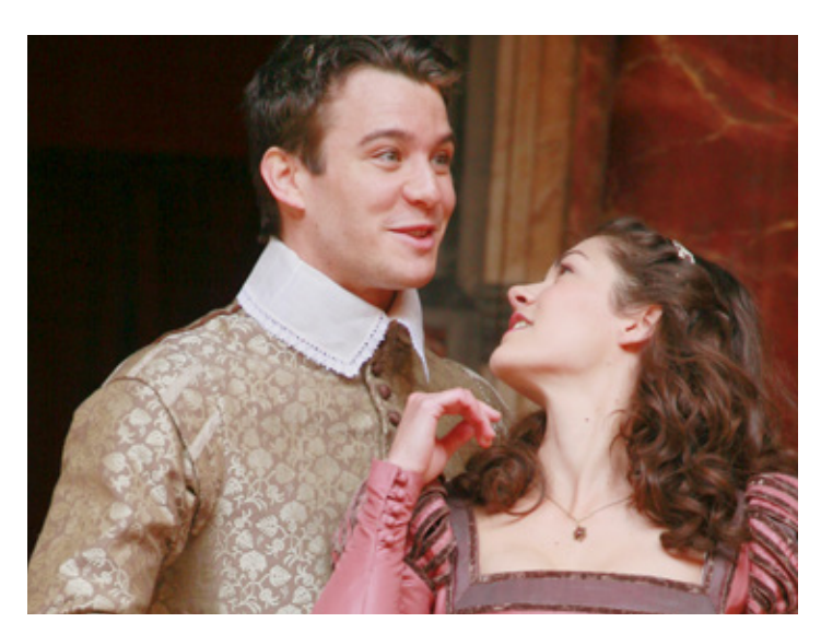
Lysander Is in love with Hermia and they run away together.