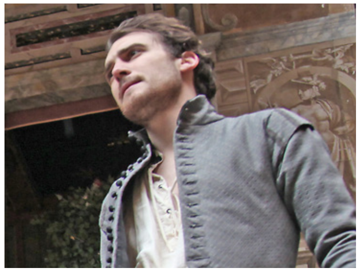
Demetrius Hermia's father, Egeus, wants Hermia to marry him instead of Lysander. He follows Hermia and Lysander into the forest.