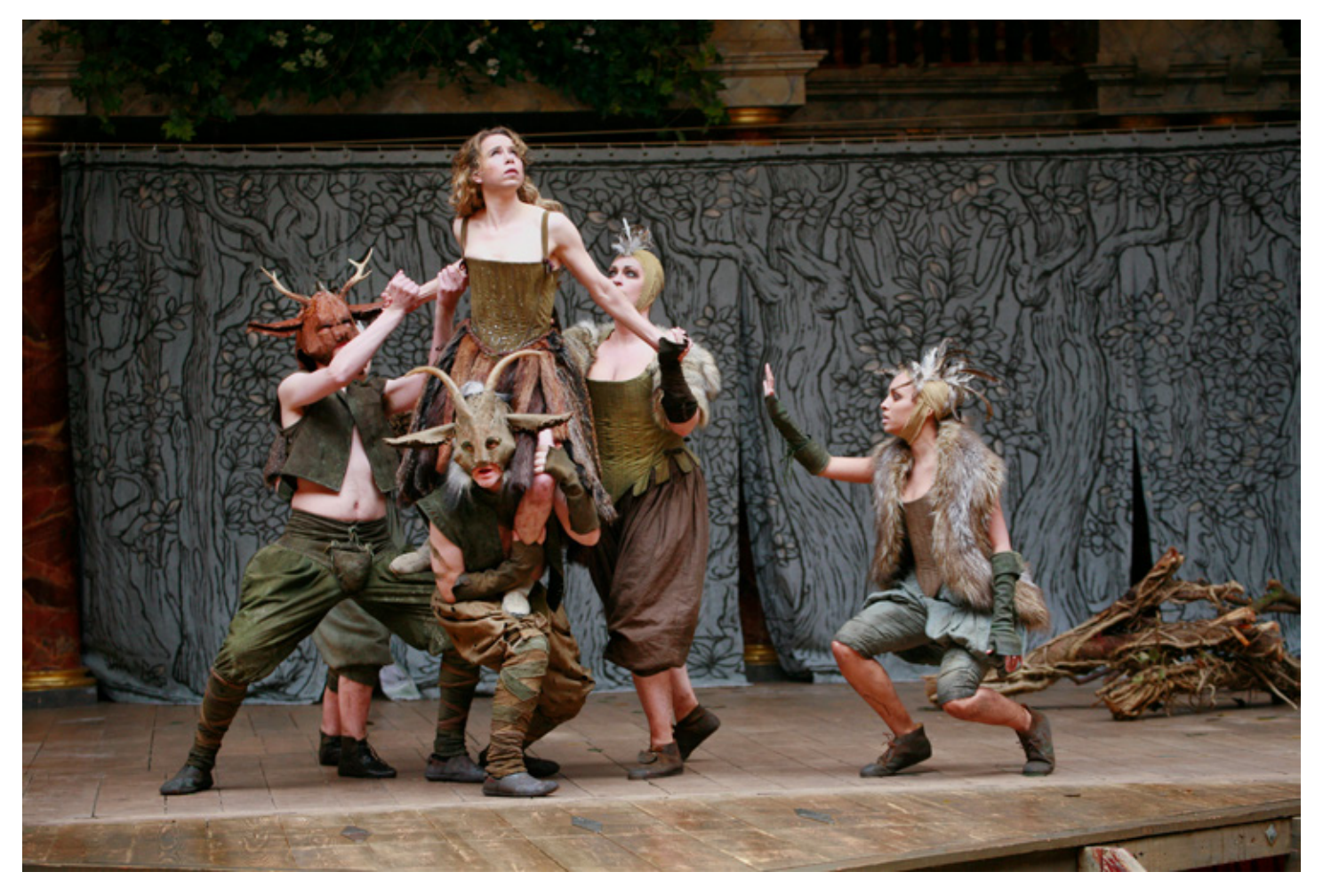
Cobweb, Mustardseed, Moth and Peaseblossom are fairies.