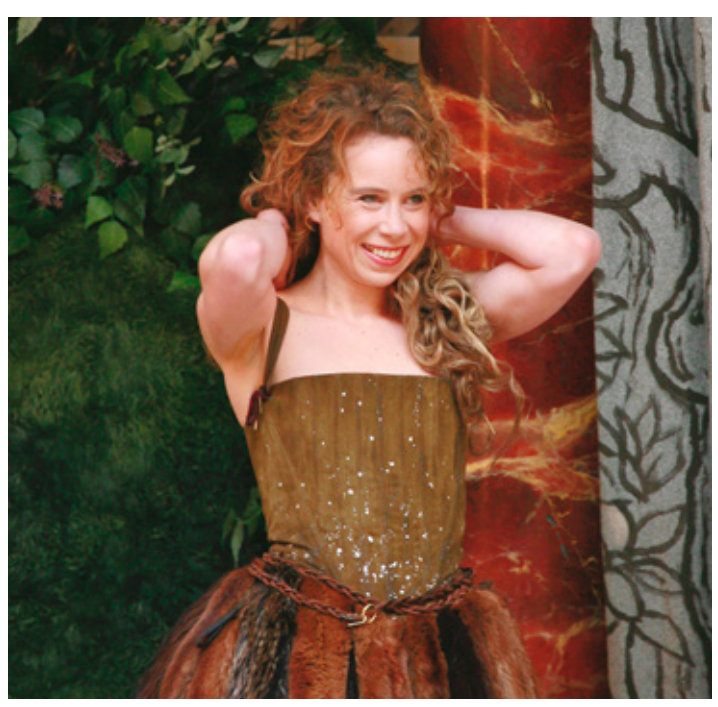
Titania Queen of the Fairies. She is married to Oberon.