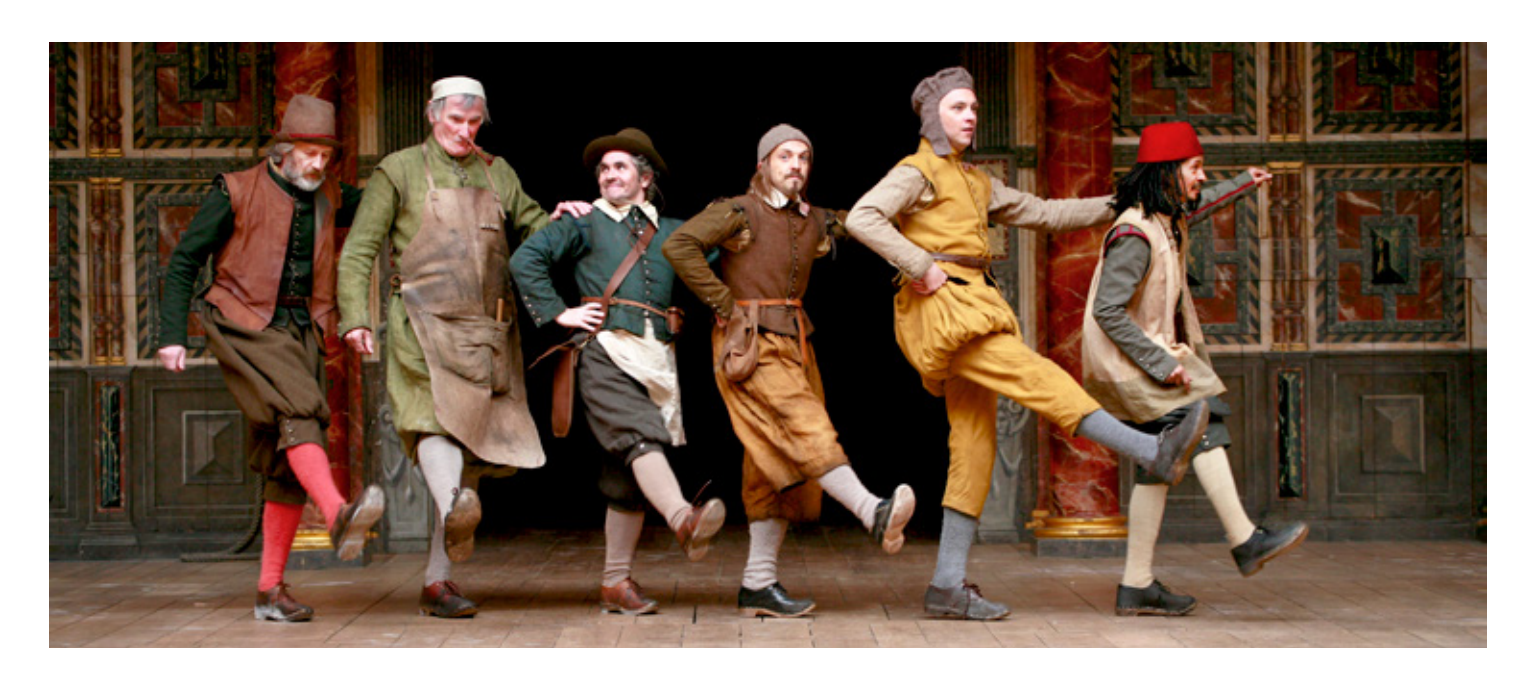
Nick Bottom, Snug, Peter Quince, Tom Snout, Francis Flute and Robin Starveling The six actors staging the play Pyramus and Thisbe.