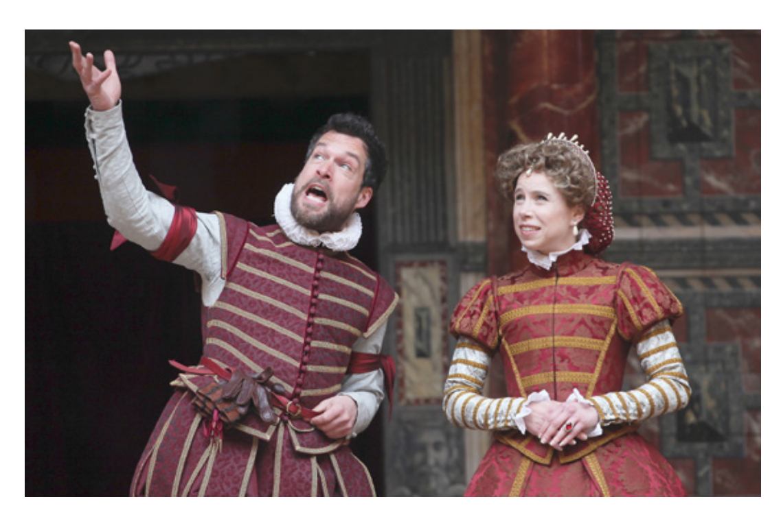
Theseus The Duke of Athens and Hippolyta . They are getting married.