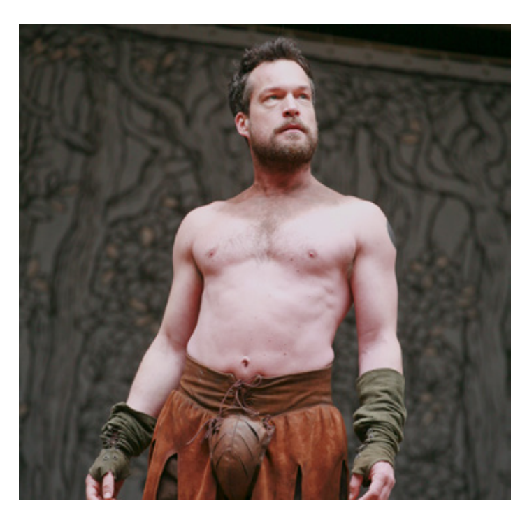
Oberon King of the Fairies. He is married to Titania, the Queen of the Fairies.