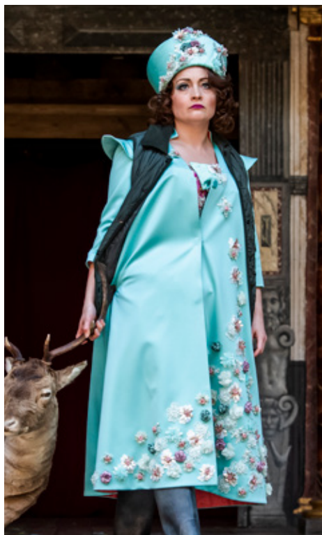
This is Hippolyta .