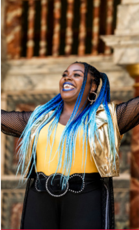
This is Quince .