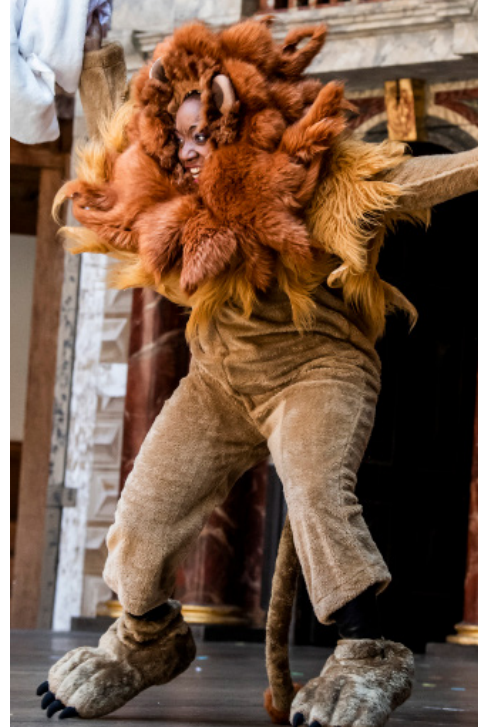
This is Snug disguised as The Lion.