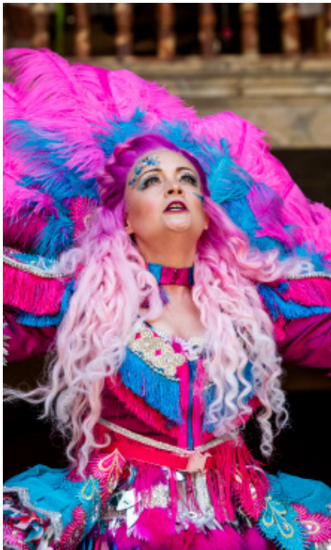
This is Titania .