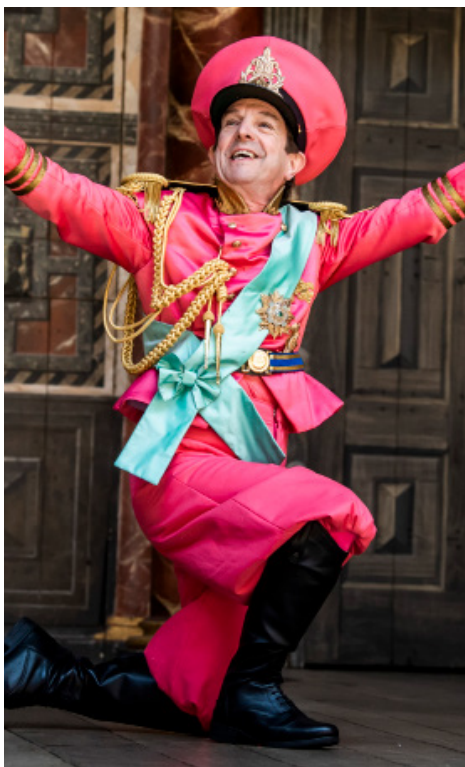
This is Theseus .