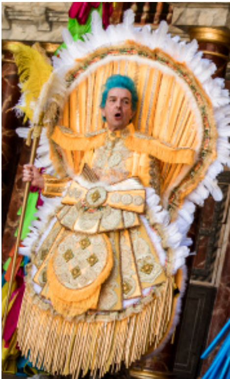
This is Oberon .