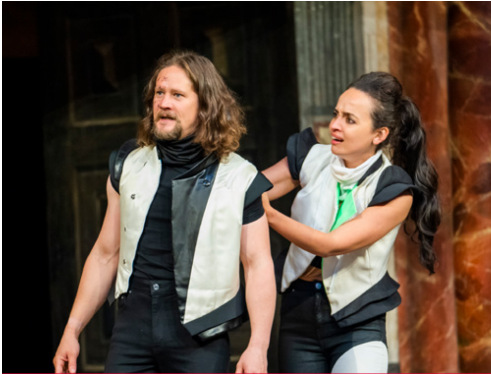
This is Lysander and Hermia .