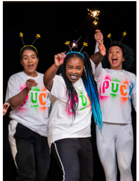
This is Puck . Many of the actors play Puck. They wear t-shirts with 'PUCK' written on them.