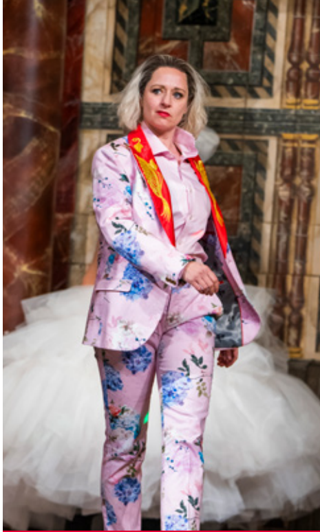
This is Bottom .