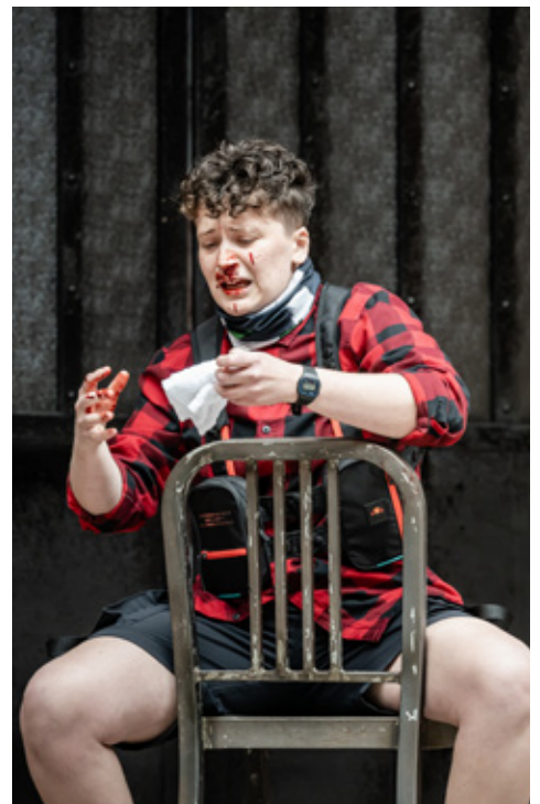
This is Benvolio .