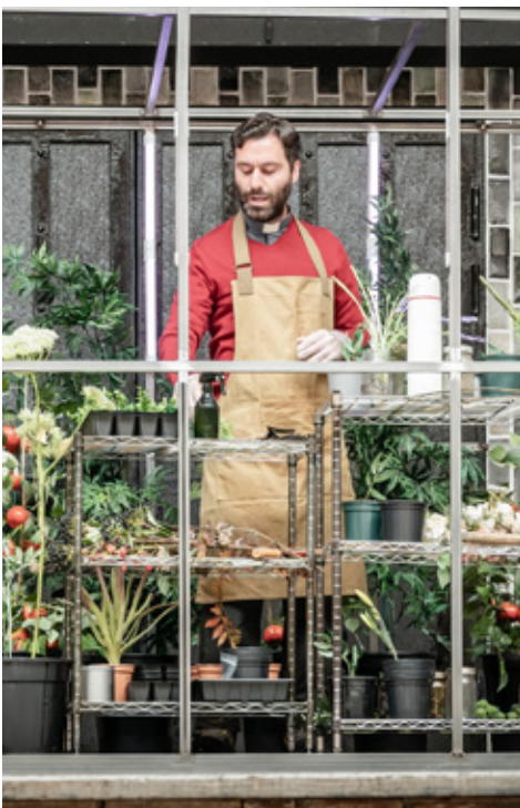
This is Friar Laurence .