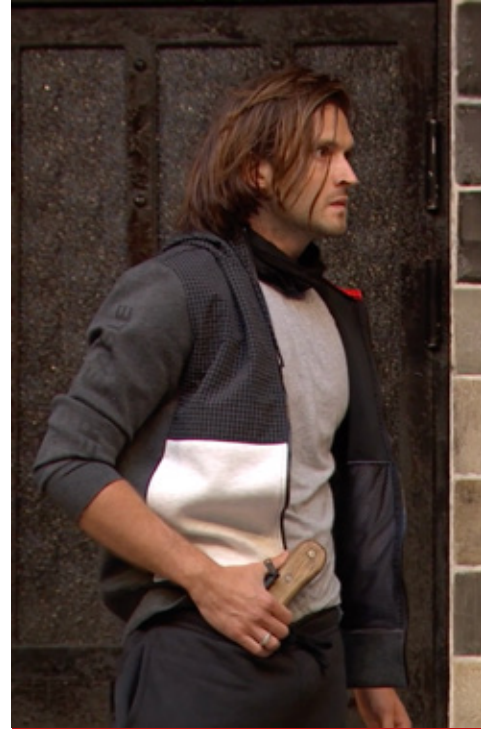
This is Tybalt .