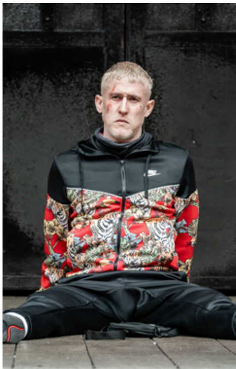
This is Mercutio .