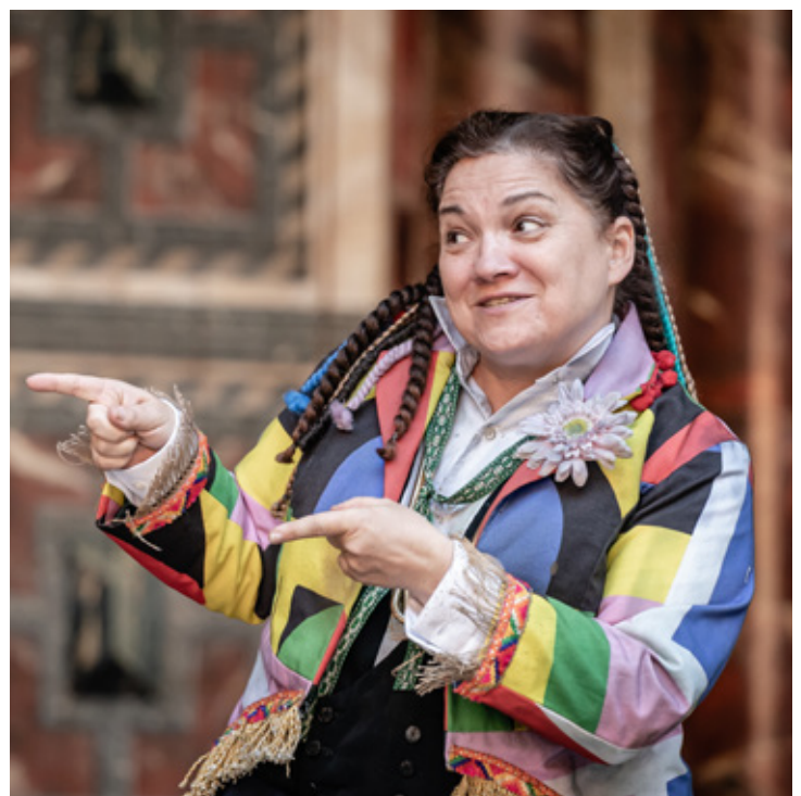
This is Touchstone .