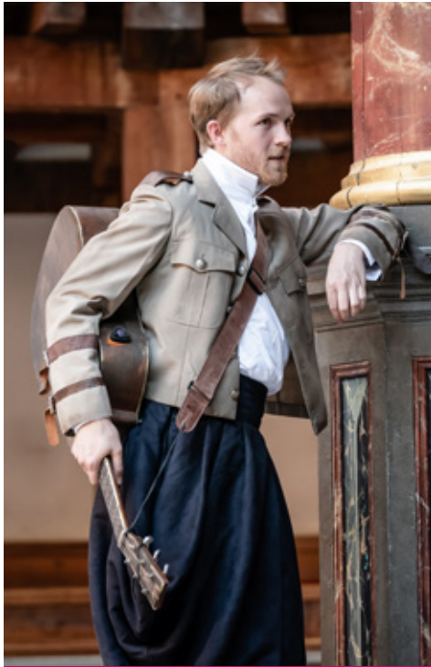
This is Amiens .