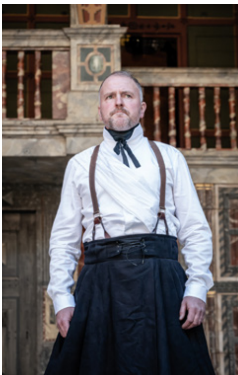
This is the Duke .