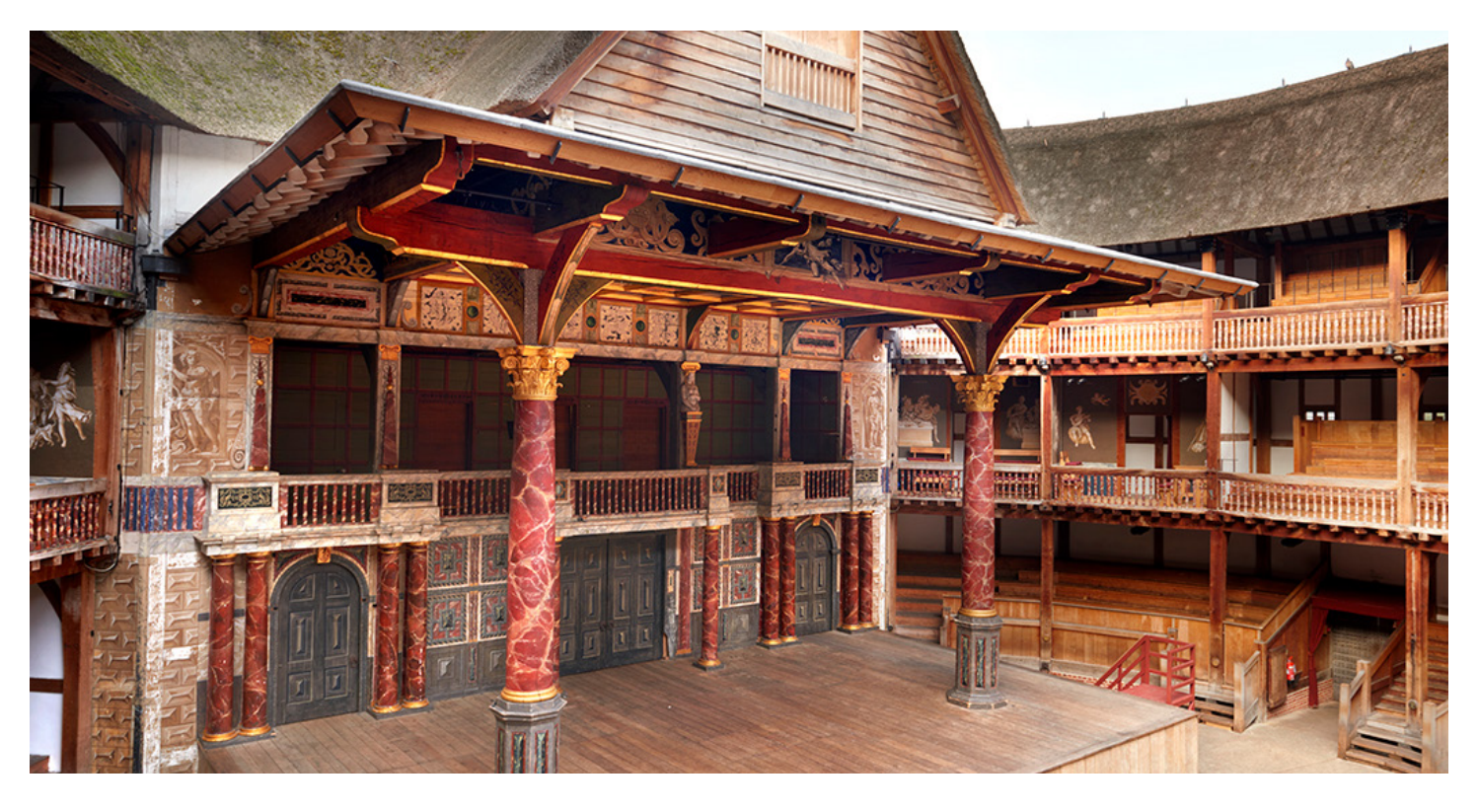
This is the stage. For different plays, designers add pieces of set to make it look different. This is where the actors will be performing.

These are stewards. You can recognise the stewards by their aprons or high-vis jackets.