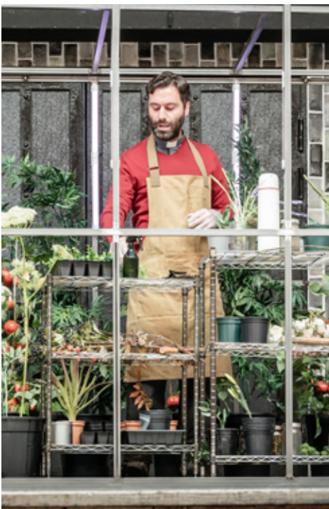
This is Friar Laurence .