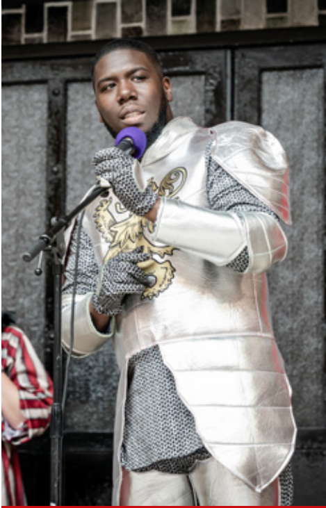
This is Paris .