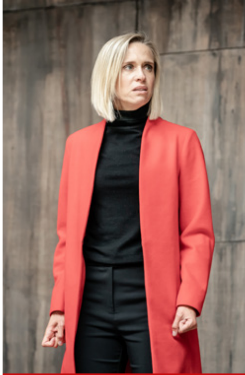
This is Lady Capulet .