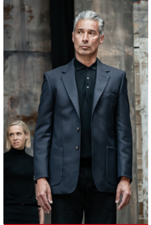
This is Capulet .