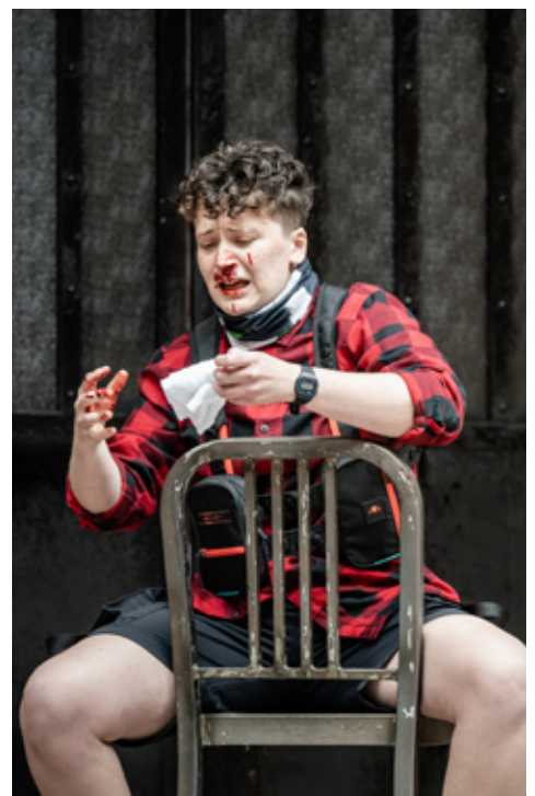
This is Benvolio .