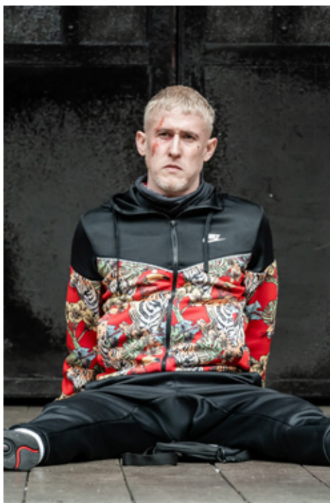
This is Mercutio .