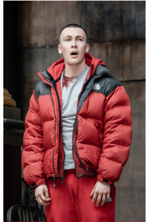
This is Tybalt .