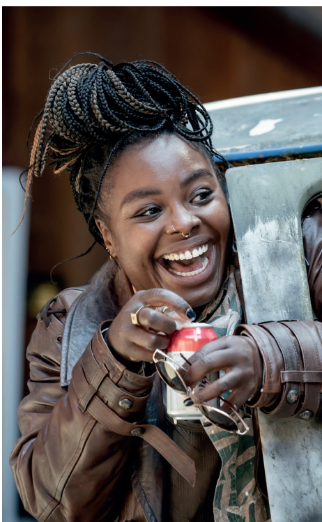
This is Toby Belch .