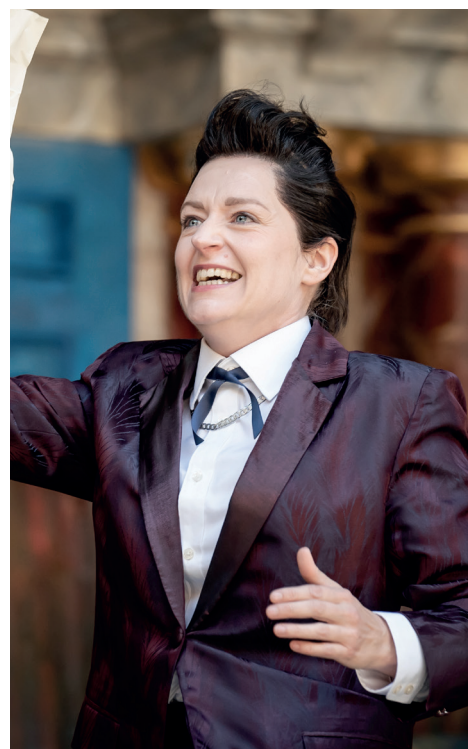
This is Malvolio .