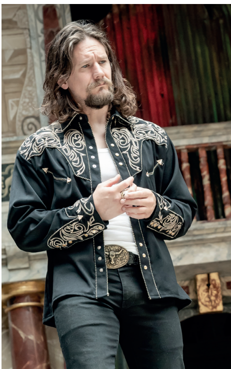
This is Duke Orsino .