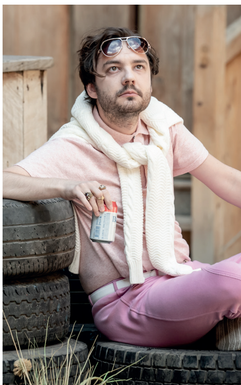
This is Sir Andrew Aguacheek .