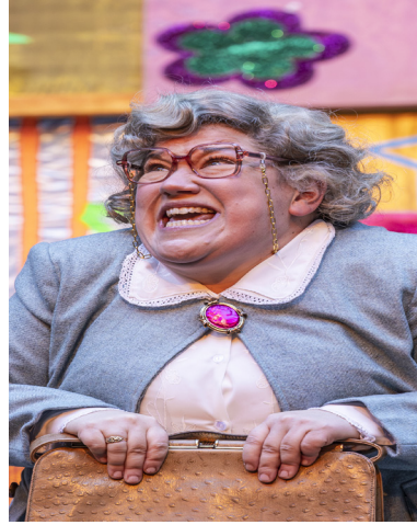
Mum / Witch