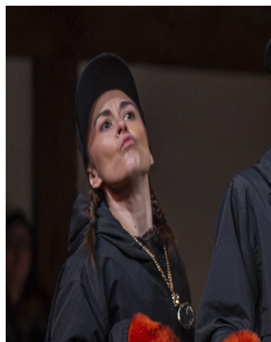
Ensemble / Cover