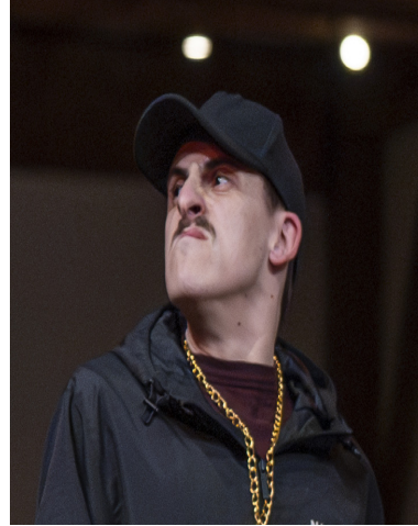
Ensemble / Cover